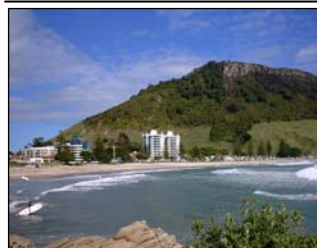
Proposed Tauranga Hotel Development Tauranga District Council