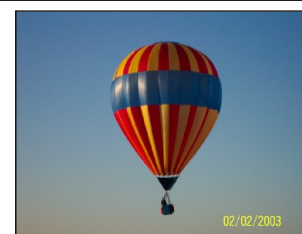
Balloons Over Waikato Hamilton City Council

Economic impact analysis Surveys of event attendees and expenditure Consultations with event promoters, organisers and other stakeholders Peer review of economic impact reports