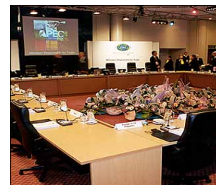
NZI Convention Hall (Aotea Centre) Auckland City Council

Market demand and supply analysis Economic impact assessments Financial feasibility studies Financial and operating projections Performance improvement reviews Business planning and budgeting Peer reviews of third party studies Food and beverage management reviews