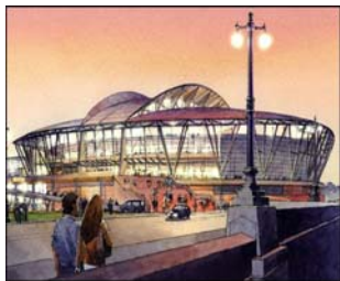
Proposed Indoor Arena Auckland City Council

Horwath Asia Pacific Ltd consultants have experience and expertise in the following services: