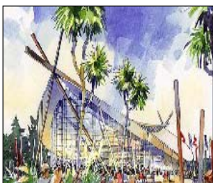
TelstraClear Pacific Events Centre Manukau City Council